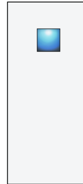
Vision Panel 10" x 10" 254 x 254 mm

Factory installed vision panels and louvers ensure proper glazing materials are used to conform with fire and safety building codes.