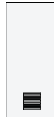
Louvre Panel 12" x 12" 305 x 305 mm