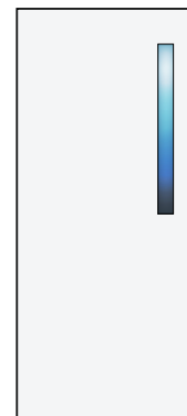
Vision Panel 3" x 33" 76.2 x 838 mm