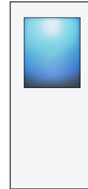
Vision Panel 24" x 30" 610 x 762 mm